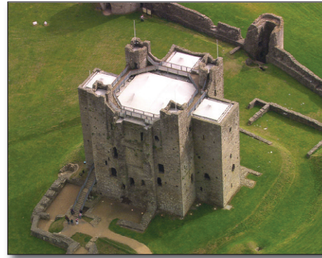
Trim Castle was founded in the twelfth century and is one of the largest medieval castles surviving in Europe.