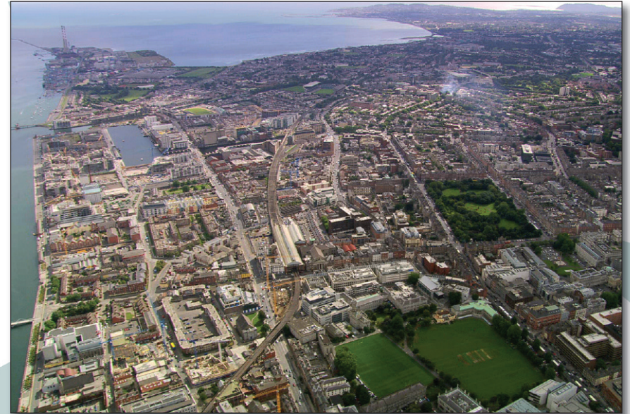
A panorama of the south east of Dublin, out to Dublin Bay.