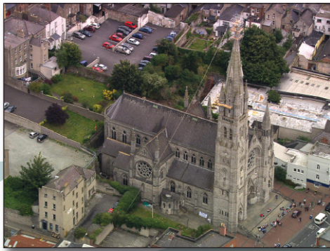
Drogheda, a Norman port, formerly one of Ireland's most important towns.