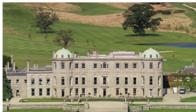
Powerscourt House was begun in the 1730s. It was gutted by fire in 1974 but has been partially restored.