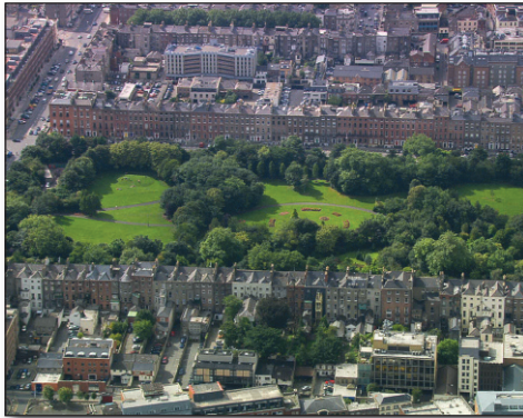
Merrion Square was laid out by John Ensor in about 1762.