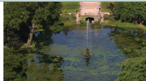
The gardens at Powerscourt are among the finest in Ireland.