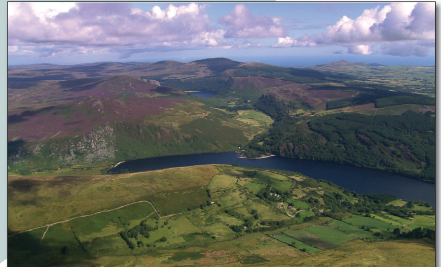
The Wicklow Mountains were severely glaciated which has helped to form their attractive mix of lakes, mountains and valleys.